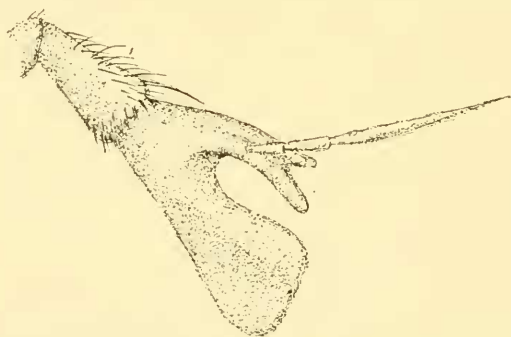
Fig. 2. Talarocera nigripennis Wied.; Antenna of female.

Professor Mik ‡ ventures the opinion that this peculiar structure of the male antennæ in Talarocera and Dichocera may be a monstrosity, as a somewhat similar structure has been observed by Strobl and himself in the female of Thryptocera exoleta Meigen, or at least in specimens that differ only in that character from typical forms. That Dichocera can be a monstrosity is disproved by the